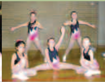
A SELECTION OF PICTURES TAKEN DURING THE AEROCHALLENGE 2007 ON SATURDAY 2 JUNE 2007.