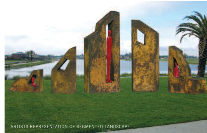
ARTISTS REPRESENTATION OF SEGMENTED LANDSCAPE